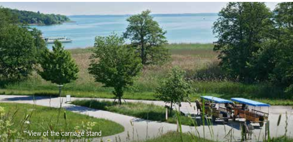
View of the carriage stand