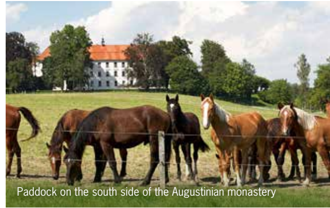
Paddock on the south side of the Augustinian monastery