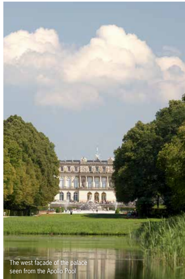
The west façade of the palace seen from the Apollo Pool