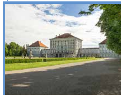
03 Munich Nymphenburg Palace and Park