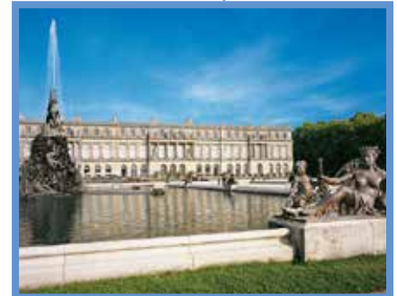
04 Herrenchiemsee New Palace and Park