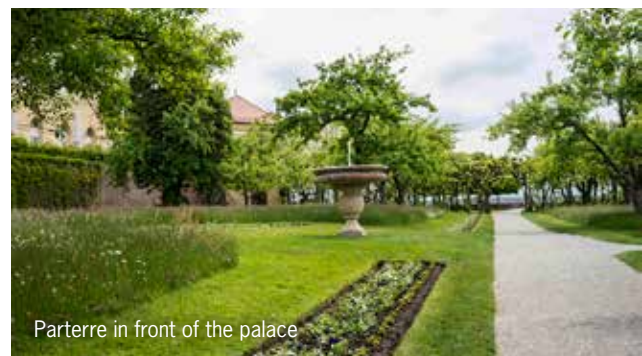
Parterre in front of the palace