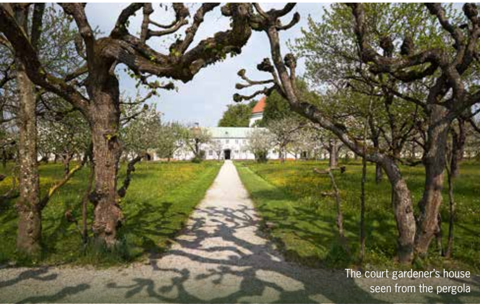
The court gardener's house seen from the pergola