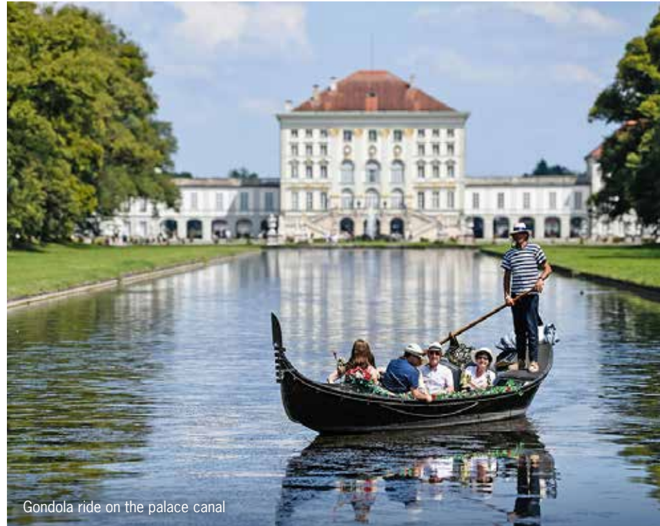
Gondola ride on the palace canal