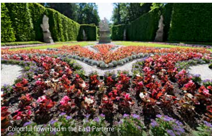
Colourful flowerbed in the East Parterre