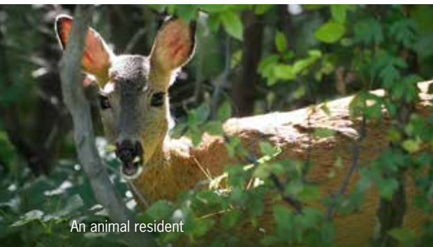
An animal resident