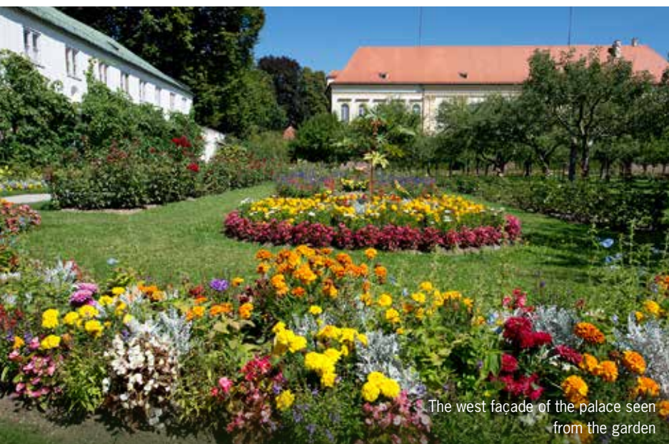
The west façade of the palace seen from the garden