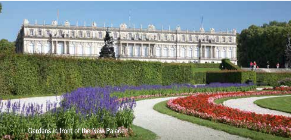
Gardens in front of the New Palace