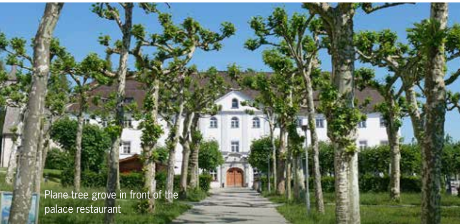
Plane tree grove in front of the palace restaurant