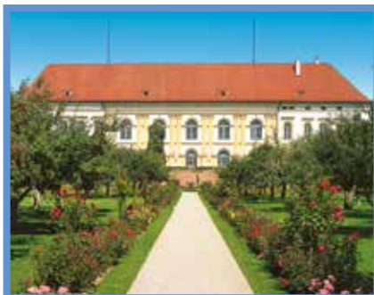
02 Dachau Palace and Court Garden Insider tip!