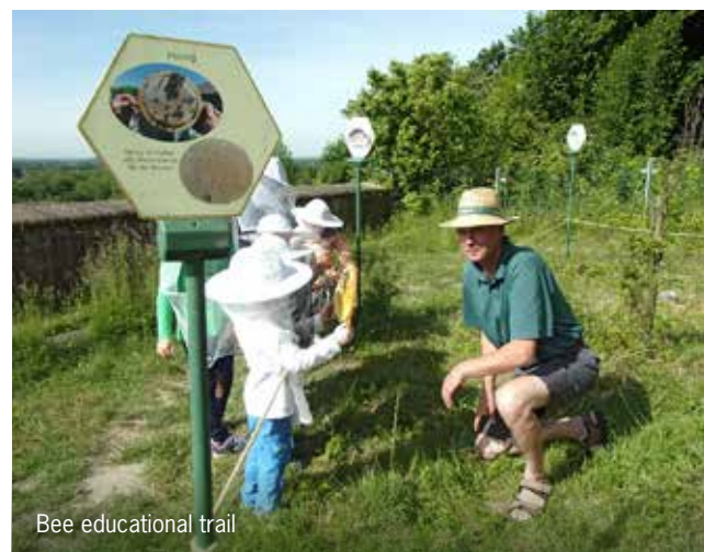
Bee educational trail