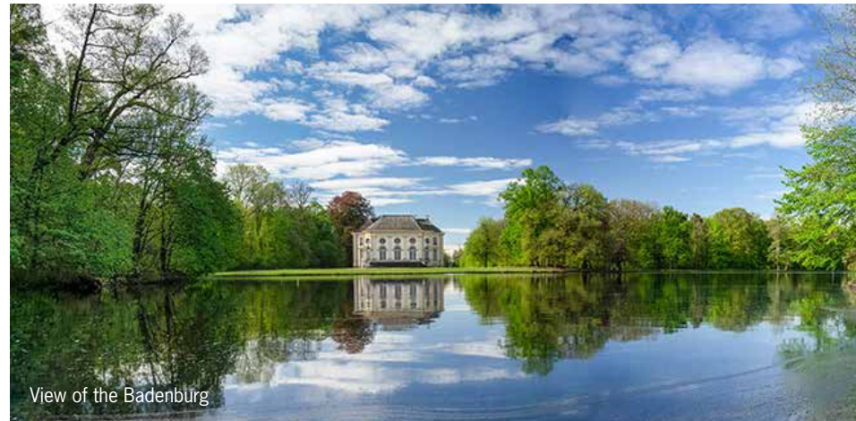
View of the Badenburg