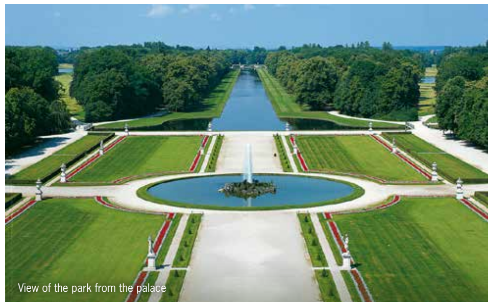
View of the park from the palace