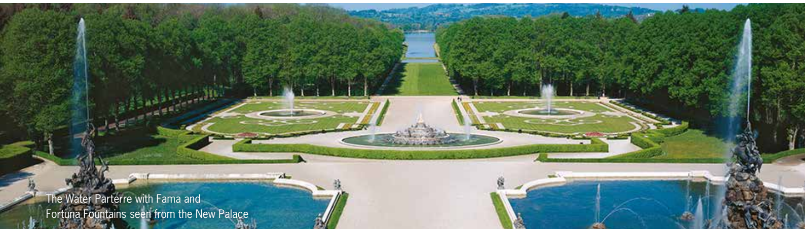
The Water Parterre with Fama and Fortuna Fountains seen from the New Palace