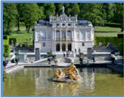
01 Ettal Linderhof Palace and Park