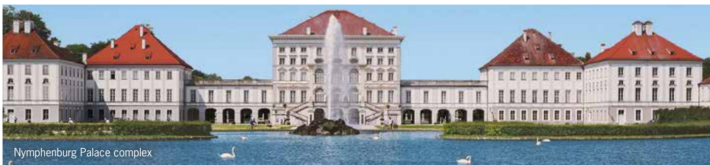
Nymphenburg Palace complex