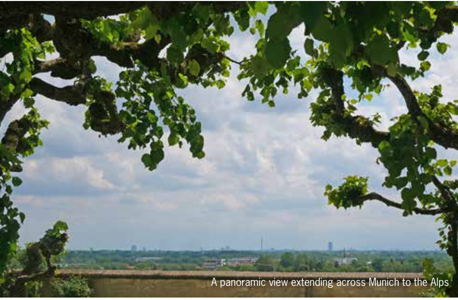
A panoramic view extending across Munich to the Alps