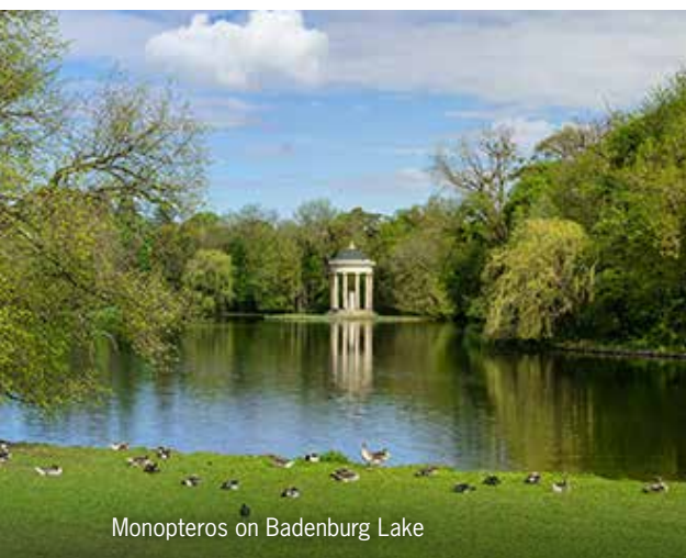
Monopteros on Badenburg Lake