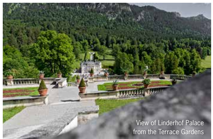
View of Linderhof Palace from the Terrace Gardens