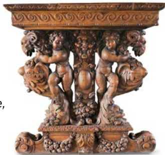
Elaborately carved table, Florence, late 16th cen- tury; Fool's Staircase (Title)

Trausnitz Castle is closed on 1 January, Shrove Tuesday, 24, 25 and 31 December.