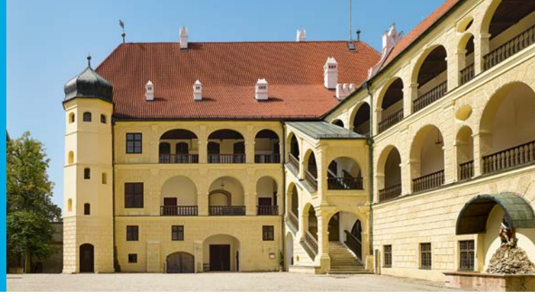
Inner castle courtyard (top); Figure of St. George by Stephan Rottaler, around 1520, from the castle chapel (centre)

Bayerischer Staatsminister der Finanzen und für Heimat